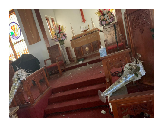
The Methodist Church of the Resurrection in Ponce, Puerto Rico, suffered extensive damage in a series of earthquakes that have rattled the country since December 28<sup>th</sup>.

...that the United Methodist Church is heavily involved in the relief efforts for victims of recent earthquakes in Puerto Rico? Well, we are!